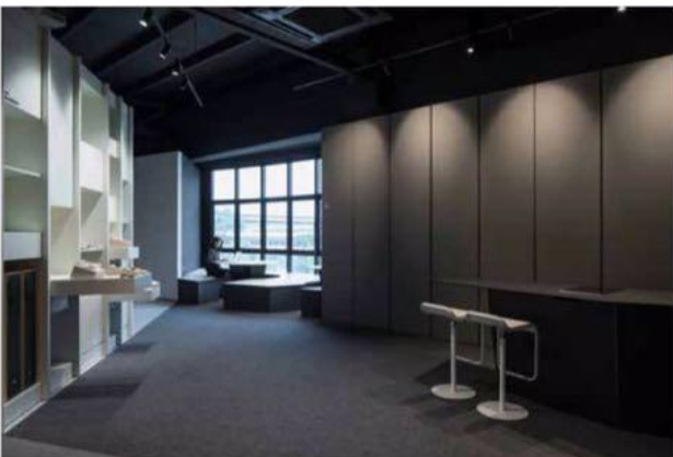
The Bar is a working kitchen covered in EDL Compact's smart nanotech laminate material FENIX NTM®. It is an opaque nanotech material that combines elegant aesthetic solutions with state-of-the-art technological performance.