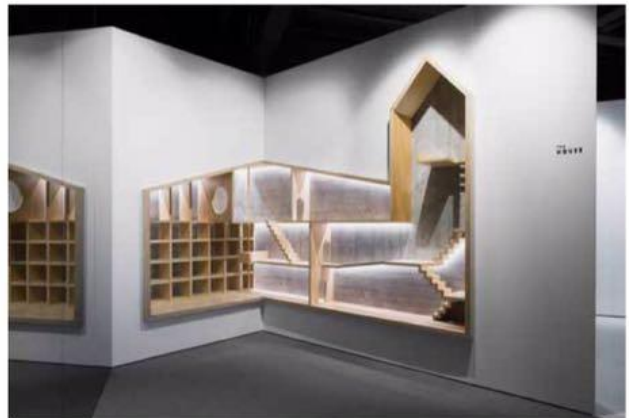
The House is a display of EDL's past and present project models from collaborative platform, EDLX, where EDL collaborates with architects and designers to push the boundaries of laminates.