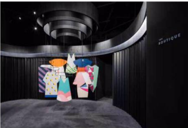
The Boutique is a resource wardrobe for EDL's pattern decors. Laminates are often said to be akin to clothes for furniture. Here, one can experience a tongue-in-cheek interpretation, where articles of clothing fashioned out of laminates are suspended to visually play with colours and textures.