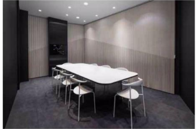
The POD is a discussion space that supports more private design discourse. Visitors can exchange ideas and make important decisions that transform real space. The creative use of laminates is applied to pre-existing systems, creating interesting vertical blinds that form an inter-changeable backdrop that instantly alters the mood and light effects in The Pod.