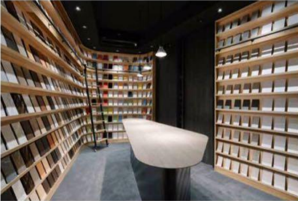
The Library is a trove of laminates. From timeless classics to the new, smart nanotech material FENIX NTM® Compact, this could be Singapore's largest library of laminates. The space features an extensive floor to ceiling collection for anyone to browse freely for design ideas and references.