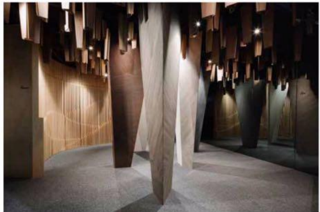
The Woods is a forest-inspired display of EDL's timber grain laminates, an evergreen choice amongst designers and homeowners for its versatility, minimalist aesthetics and durability. It features an iconic profiled plywood landscape backdrop that conceals a physical reference library for timber grain laminates.