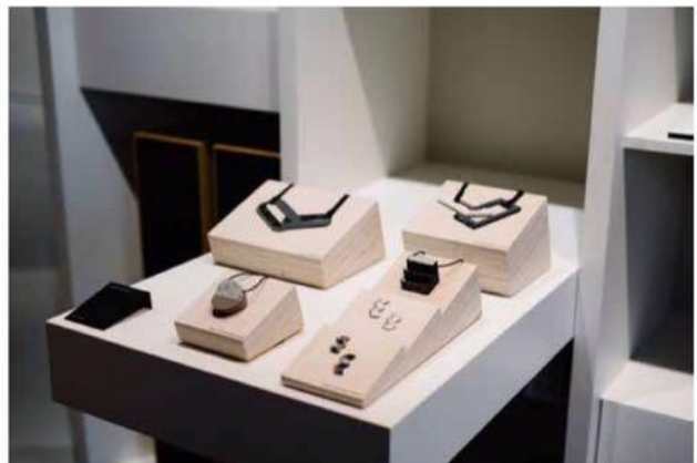
The Market is a retail showcase of various jewellery and product designs by local and international designers from various disciplines. Using EDL laminates and compacts, these are inspirations that push boundaries beyond conventional interior applications.